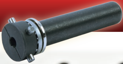
Gearbox with QD Design