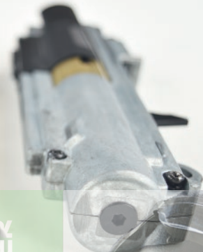
Standard Gearbox Design