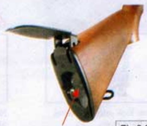
Battery Compartment Lid Fig 3.2