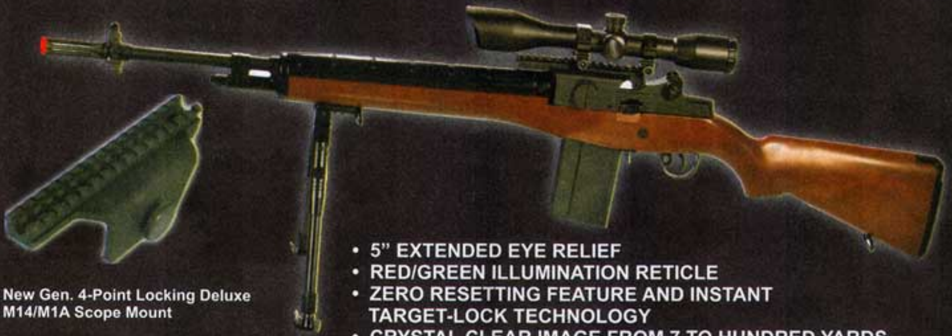
New Gen. 4-Point Locking Deluxe M14/M1A Scope Mount

4x40 Full Size TS Platform Scope, Side Wheel Red/Green Illumination Rhesostat, Mil-Dot Reticle, Sapphire Lenses.