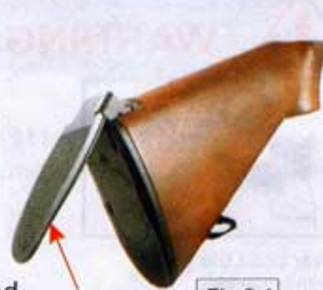
Butt Pad Cover Fig 3.1