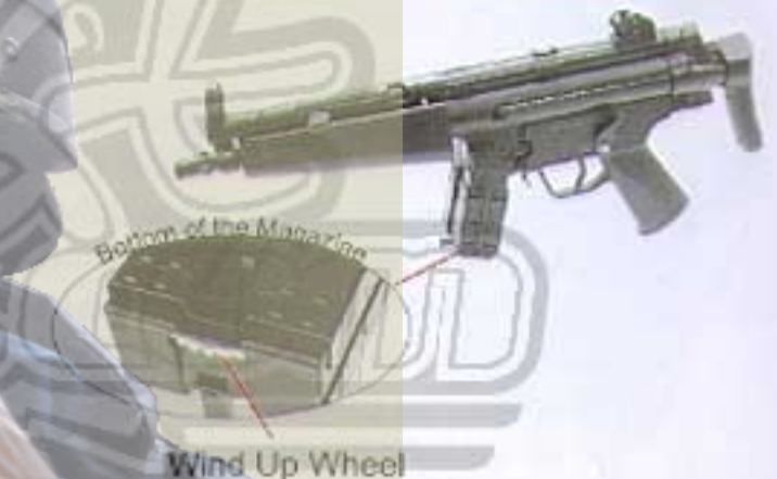
Wind Up Wheel