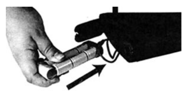
3. Carefully insert the stock. Close cover.