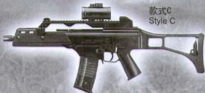
款式C Style C