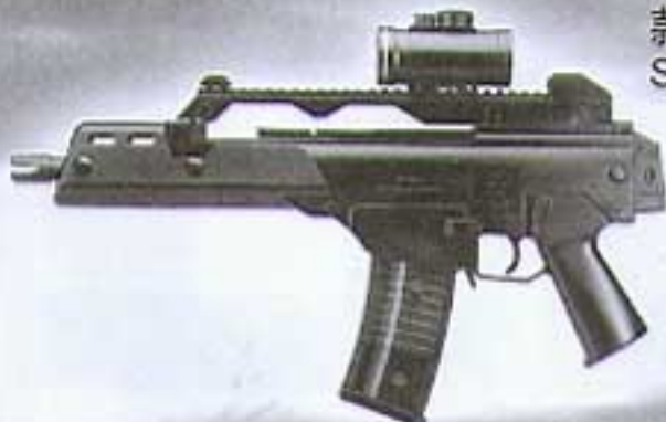
款式B Style B