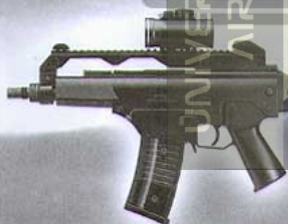
款式A Style A