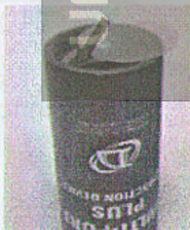
Install the phonation slice (do not install too tight)