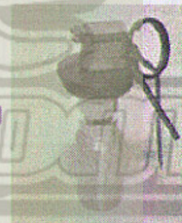
Install handle and safety key and assemble the body by rolling the upper body clockwise.