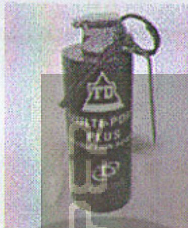
Uninstall handle and safety key.