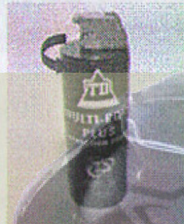
Roll the upper body anticlockwise to open the body.