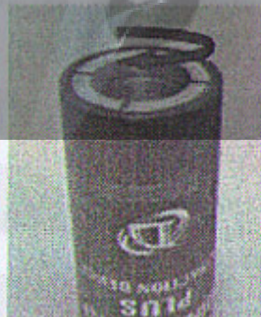
Use the key to assemble the bottom covers.