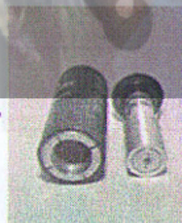
Assemble the last piece of outer covers.