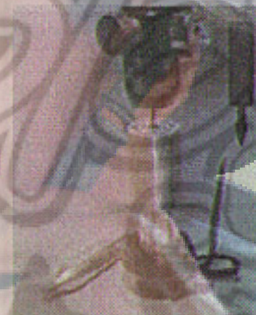
Insert CO2 for 5~7 seconds.