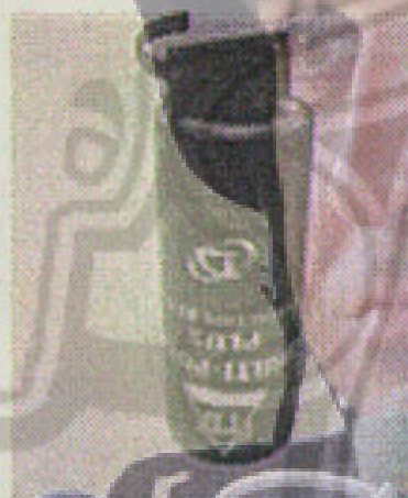
Use the key to disassemble the bottom covers.