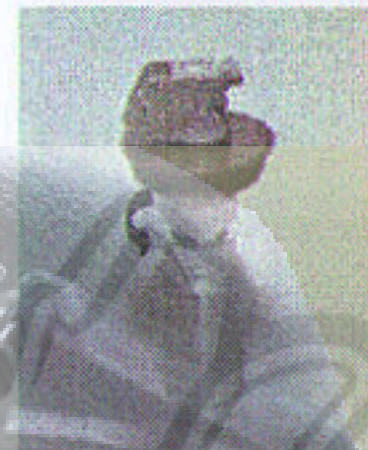
Disassemble the body by rolling the upper body anti-clockwise.