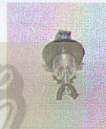
Adjust the switch to control the time of explosion (Clockwise - extend the time and vice versa).