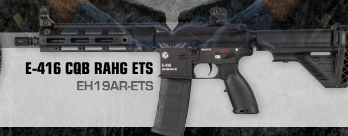
E-416 CQB RAHG ETS EH19AR-ETS