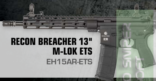
RECON BREACHER 13" M-LOK ETS EH15AR-ETS