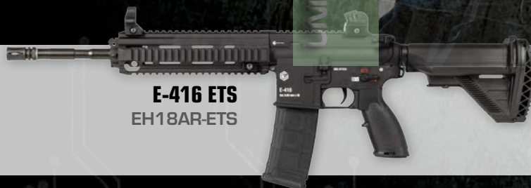
E-416 ETS EH18AR-ETS