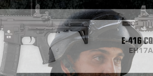
E-416 CQB ETS EH17AR-ETS