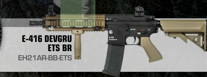
E-416 DEVGRU ETS BR EH21AR-BB-ETS