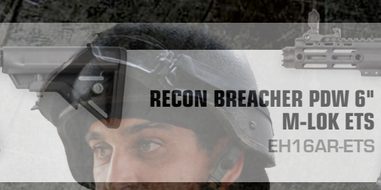
RECON BREACHER PDW 6" M-LOK ETS EH16AR-ETS