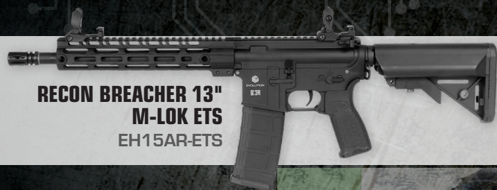
RECON BREACHER 13" M-LOK ETS EH15AR-ETS