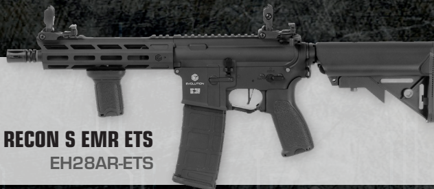
RECON S EMR ETS EH28AR-ETS