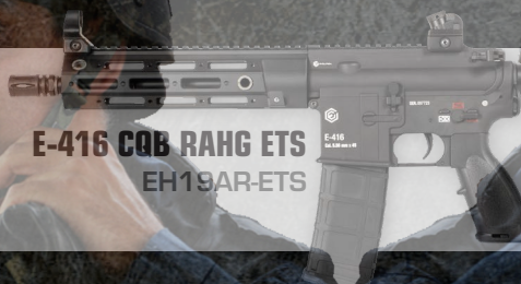
E-416 CQB RAHG ETS EH19AR-ETS