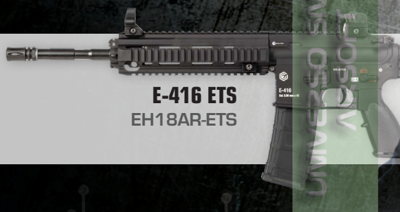
E-416 ETS EH18AR-ETS