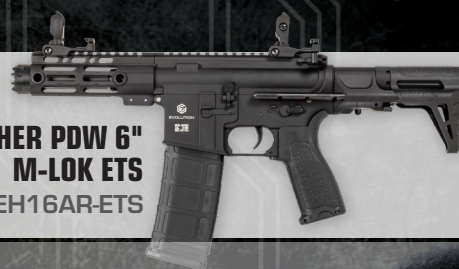
RECON BREACHER PDW 6" M-LOK ETS EH16AR-ETS