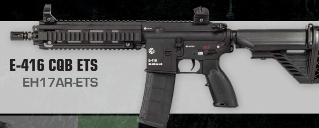
E-416 CQB ETS EH17AR-ETS