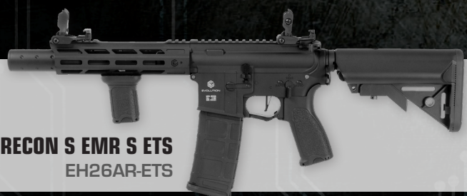
RECON S EMR S ETS EH26AR-ETS