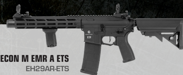
RECON M EMR A ETS EH29AR-ETS