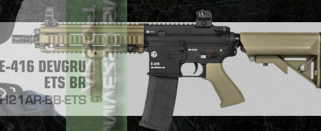
E-416 DEVGRU ETS BR EH21AR-BB-ETS