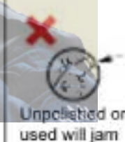
Unpelleted or used will jam