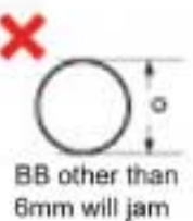
BB other than 6mm will jam