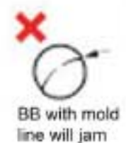
BB with mold line will jam