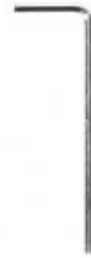
2.5mm Allen Key Provided and used to adjust the Hop Up

When adjusting the Hop Up for the ASR you need to test fire in a SAFE location and know what is past the target to prevent damages and or injuries.