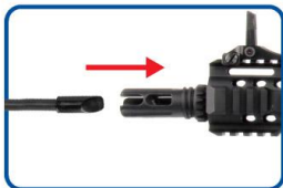
Return the hop up dial to normal position and insert the cleaning rod from the lead edge of the inner barrel.