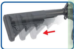
Adjust the position ( 6 position ).