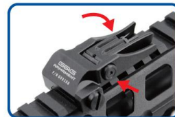
Front Sight - Press the button and Fold down