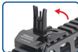
Front Sight - Flip up