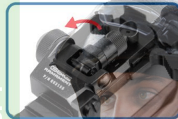
Rear Sight - Flip up