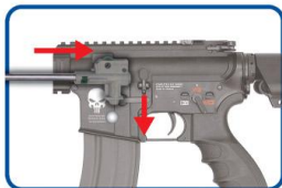
Be aware to have the rod facing down and reaching to the end, and remove clogged pellets.