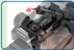
Rear Sight - Flip up