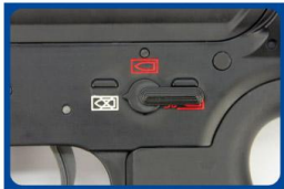
Safety On The gun will not fire