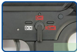
Semi Auto Single shot