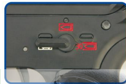
Full Auto Automatic firing