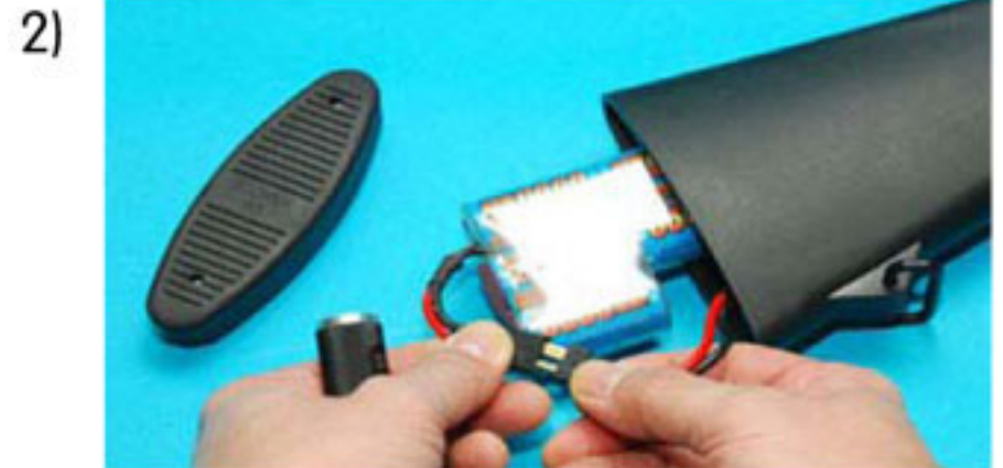
接上電池後再裝回尾蓋 Connect the battery & replace the stock