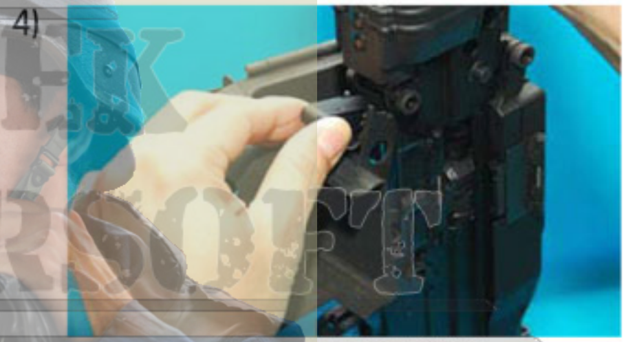
鎖好B點的彈架鎖制 Lock point B.