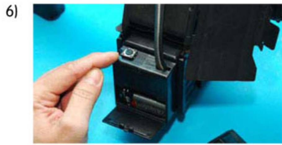
彈箱備有後備上彈制,方便用家在發射前已填滿送彈槽內的子彈,下方為裝9V電池位置 A button for uploading BB to fill up the bullet trough before start. 9V battery required.