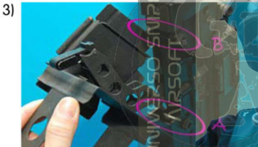
接上A點及B點之圓軸位來扣上彈箱架 Install the pins at point A & B to secure the magazine holder.