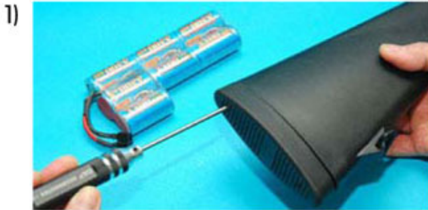
鬆開尾托蓋內藏的螺絲來取開尾蓋 Release the screw from the stock