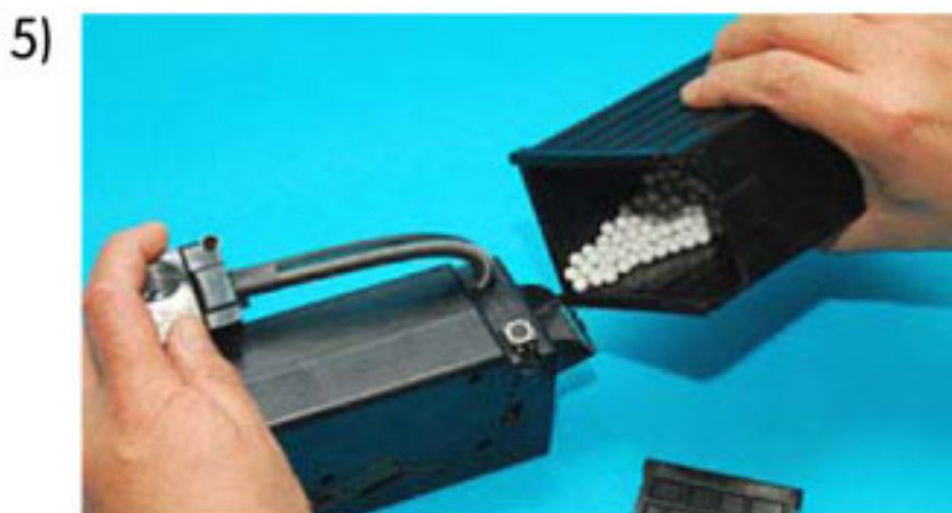
可用外盒注入子彈於彈箱口 Can fill up the drum with magazine box.