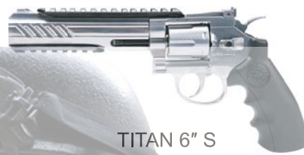
TITAN 6" S