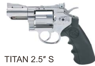
TITAN 2.5" S