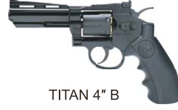
TITAN 4" B