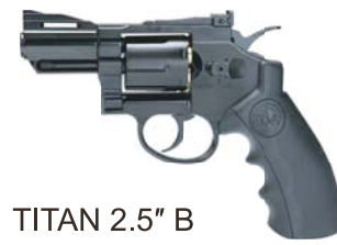
TITAN 2.5" B