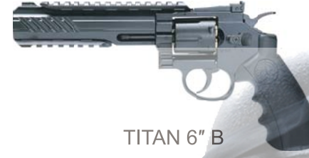
TITAN 6" B