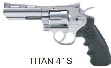
TITAN 4" S