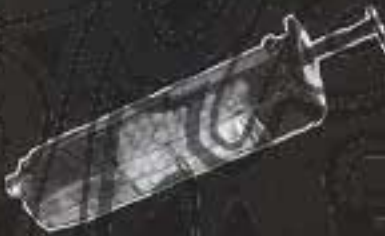
OPTIONAL - UTG 4X32 COMBAT TACTICAL SCOPE WITH RINGS