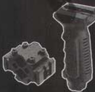
OPTIONAL - UTG TRI-RAIL BARREL MOUNT AND POWER FOREGRIP