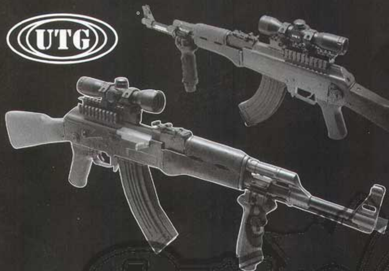
DOUBLE HI-CAP MAGAZINES