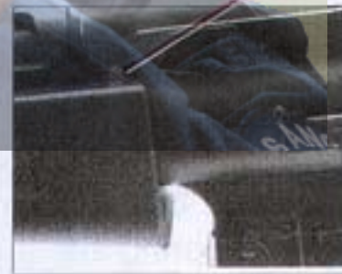
Hop-Up Adjustment Switch