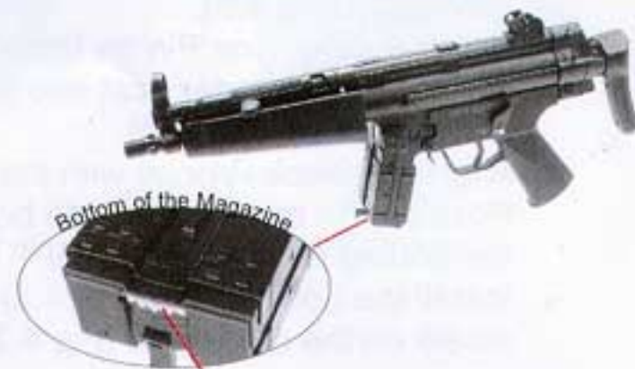
Wind Up Wheel

While the magazine is designed to hold large capacity BBs, it requires BBs to be fed by batches into Ready Tube. When a batch of BBs is used up, rotate the Wind Up Wheel to draw Bbs into the Ready Tube for more shots.