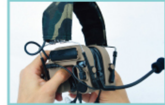
6. Finally, the microphone is already installed on the right side of the headset, you can start using.