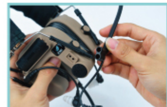
4. Second, please send the microphone move to the right, installation on the guide rod.