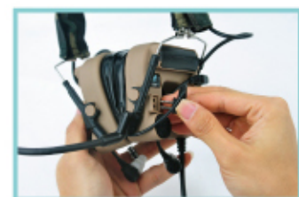
2. First, please put the microphone connecting line plug pull out.