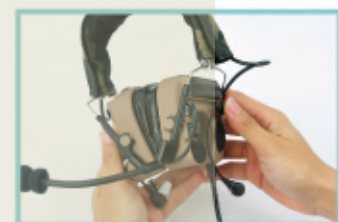
1. ZCOMTAC IV default state is: The microphone installed on the left, conform to most people and most occasions to use, if you need to change the position of the microphone, please follow the following method to change.