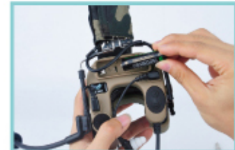
2. Follow the "+" and "-" logo to install AA battery for both side headset.