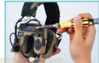
1. Pry the battery case open with a "J" shape screwdriver.

To replace the batteries, insert a tool under the edge of the battery cover. Loosen each side a bit, then lift off the entire cover. Recommend to remove the batteries when storing the hearing protector for a long time. Check the function of the unit after replacing the batteries.