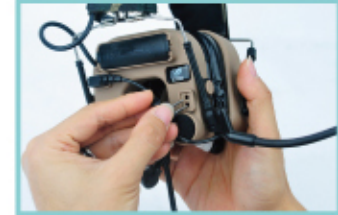
5. Then, please plug in the microphone connecting line, (long needle upward).